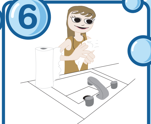
Step #6: Dry your hands.