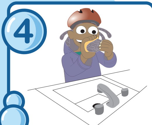
Step #4: Don't forget your fingernails. Use a nailbrush if you have one.