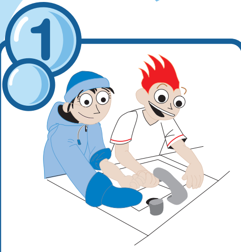
Step #1: Wet your hands with warm water.