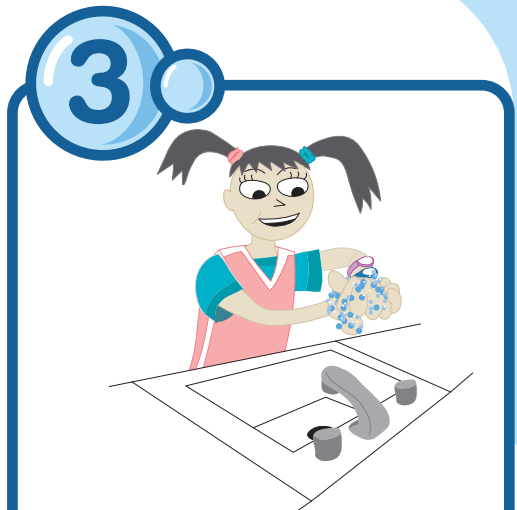
Step #3: Rub your hands together, and even get between those fingers for 20 seconds.